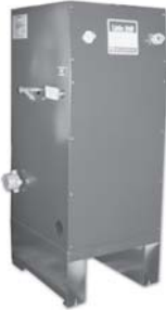
Vacuum attachment for LS55 shown here